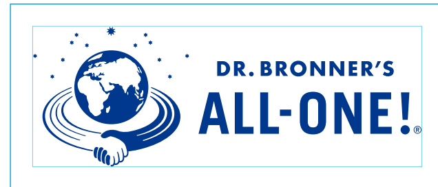
Minimum clearance for horizontal logo